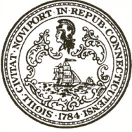
Justin Elicker Mayor