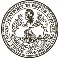
Justin Elicker Mayor