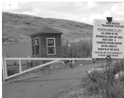
Residential Waste Center @ Transfer Station

The coupons are redeemable at the Transfer Station where an attendant is on duty to accept them. Recycling bins are also located near the Transfer Station.